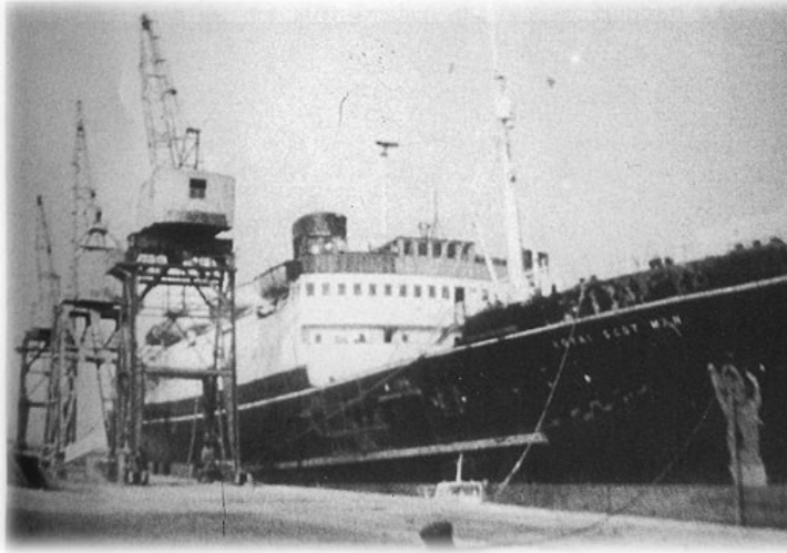
Royal Scotsman (Granada Television Ltd)

LRH and a crew picked it up in Southampton.